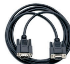
PM001601 Programming cable pg. 98